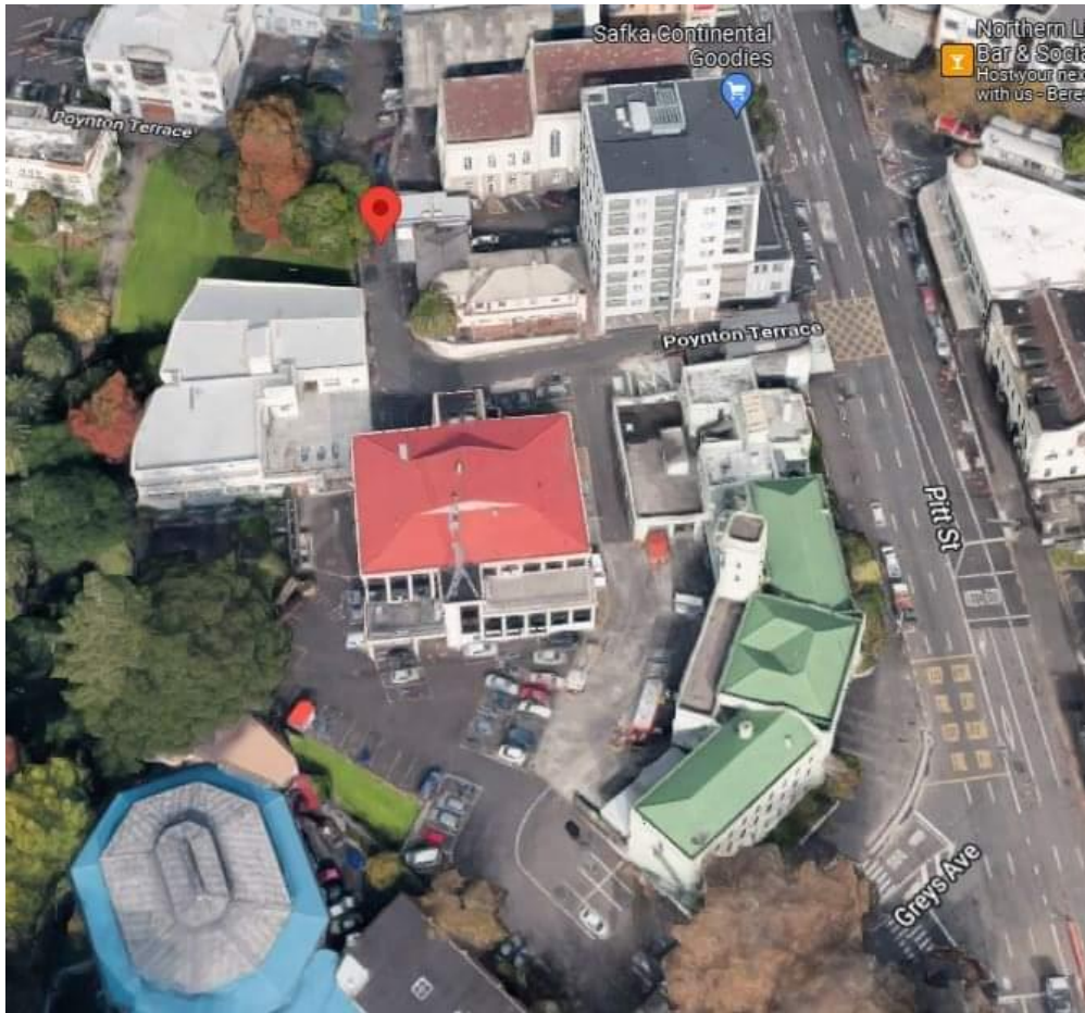
Aerial View of New Region HQ Building (Orange Roof).