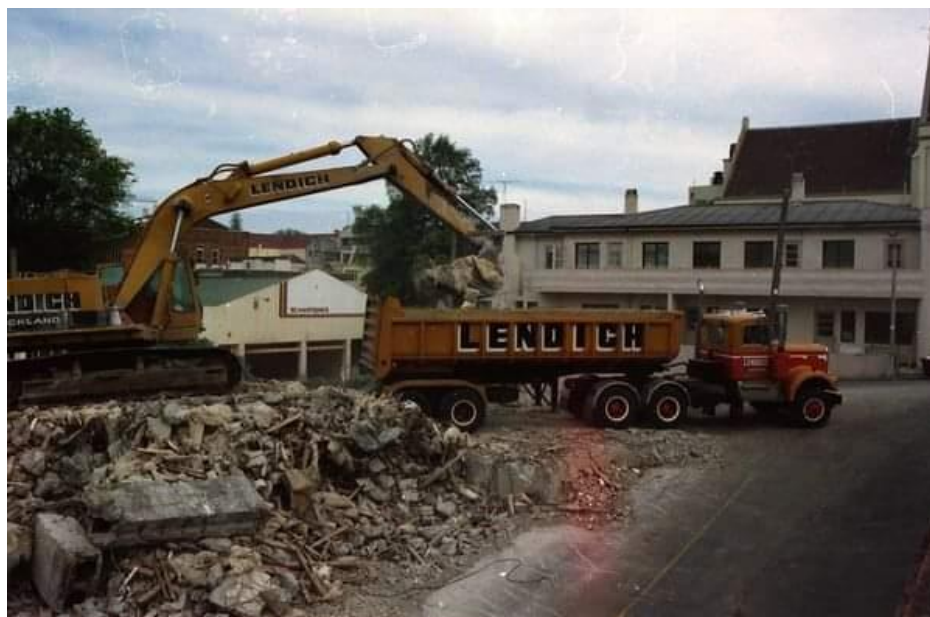
Lendich Demolition demolishing Block 6-12 on the Station Ramp.

August 1983. Demolition of three blocks of Headquarters quarters commenced. 6 to 11 on the ramp, 16 to 19 and 20 to 21 both at the back, Pitt Street, Newton. Contractor Lendich struggled at first with equipment they brought in, so heavier machinery brought on site which still had a hard job with all the steel reinforcing and heavy concrete. Took about three weeks, six days a week. Site cleared to build new Region Office, a building of three floors, estimated to cost $3,172,000, occupied mid-1986.