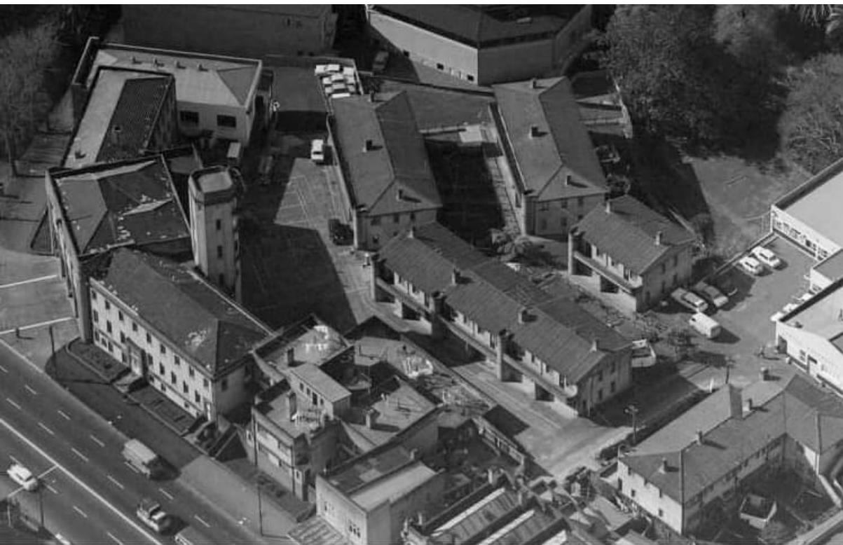
An Aerial View of all the Flats. The Shirt Factory, Greys Ave top left, northern end of Station. The Flats facing Pitt St south eastern end of Station still exist (2023).